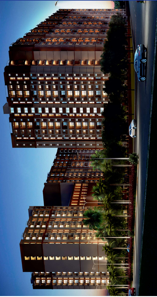
Artistic impression of the building